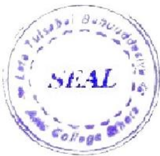
Principal Art's College, Sihora Tah. Tumsar, Dist. Bhandara