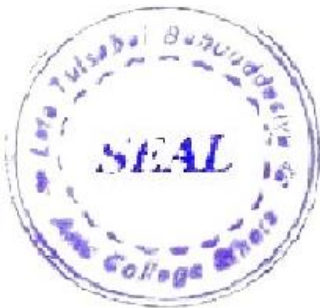
Principal Art's College, Sihora Tah. Tumsar, Dist. Bhandara